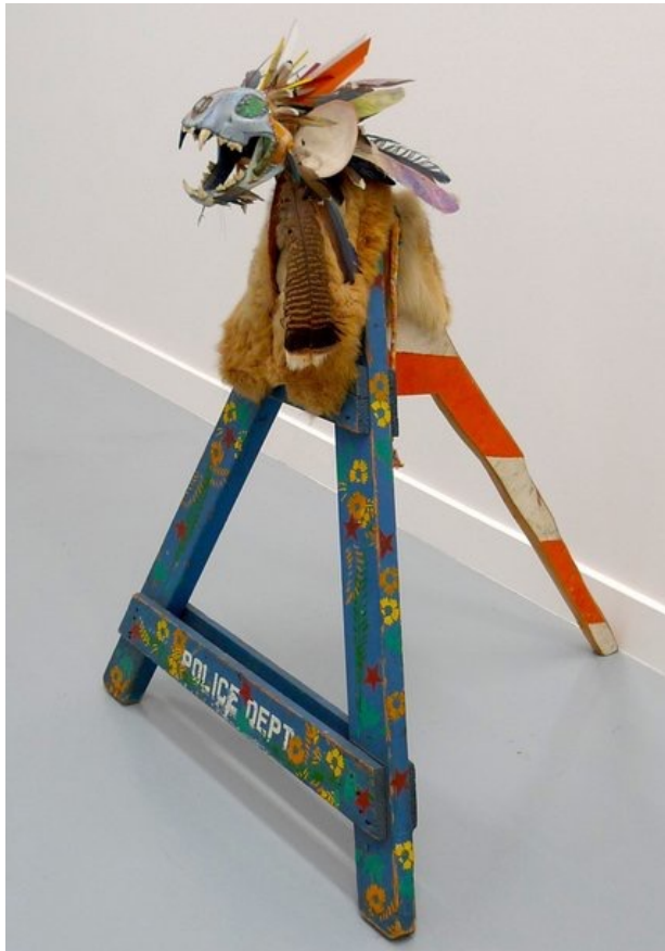
"Tlunh Datsi," a work from 1984 by Mr. Durham. Jimmie Durham

His lack of registration also fueled an allegation by a retired Cherokee judge, cited on Mr. Durham's Wikipedia page, that he is a "poser" and not really Cherokee. Mr. Durham pointed out that "many Cherokees are not registered. My family didn't even think about registering." He criticized tribal enrollment efforts, originally backed by the Bureau of Indian Affairs, as a "tool of apartheid."