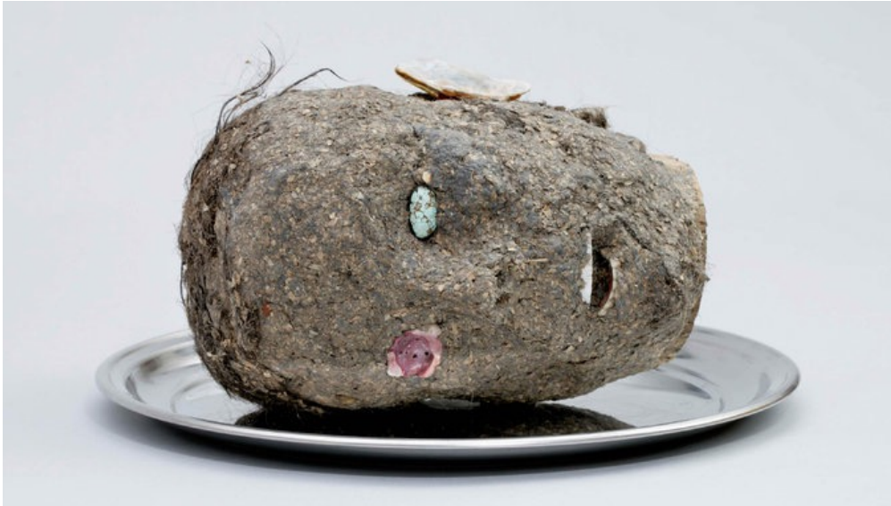
"Head," from 2006.

"That's not really the case," Mr. Durham explained in a rare interview, conducted over three Skype video calls from Naples, Italy, where he and his partner, the artist Maria Thereza Alves, have turned a 12th-century convent, more recently used as a leather factory, into a studio with living quarters. He said he couldn't visit Los Angeles this year on doctor's orders.