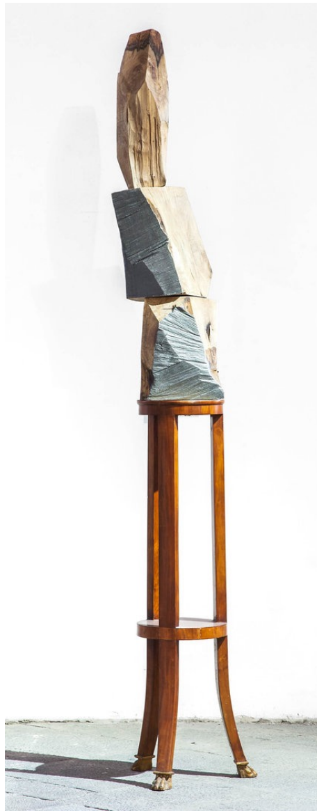
"The Forest and Brancusi," from 2012.

Jimmie Durham, via Kurimanzutto, Mexico City