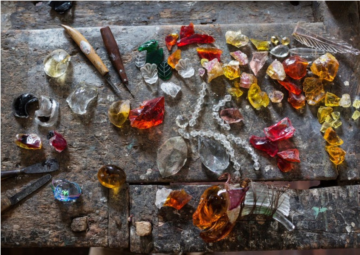
Pieces of Murano glass used by Mr. Durham.

His work began to confront Native American stereotypes. In 1985, he built museum-like displays of faux-Indian specimens. One was a handprint on paper made with red paint and his blood; another was “Pocahontas underwear,” a garment he made of dyed-red chicken feathers and beads, putting Native American craft materials to startling use.